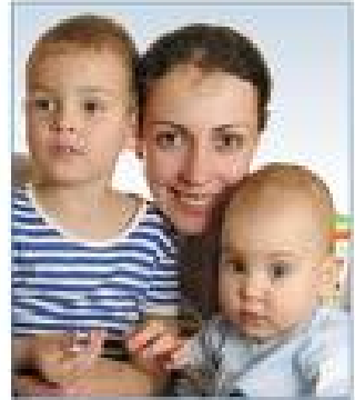
Name and photo are representative of this client.