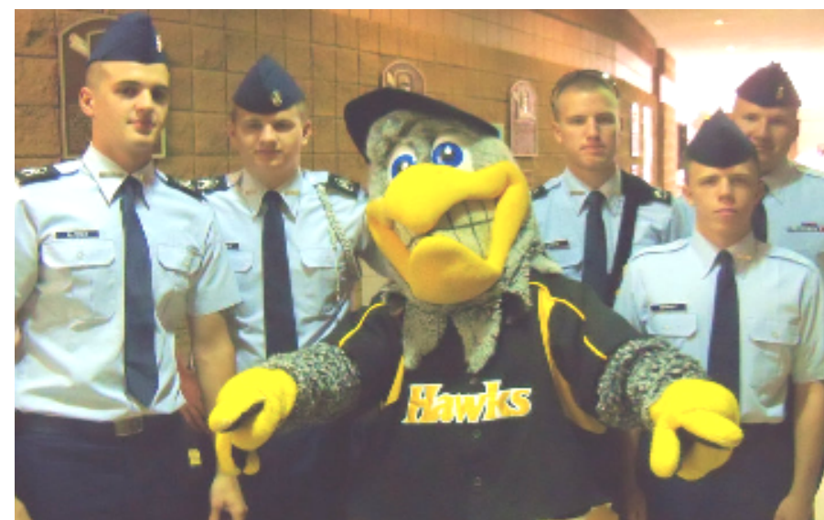
Pictured here are members of the Clay High School Junior ROTC and Swoop.